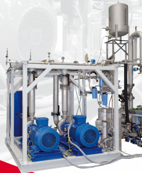
Capacity: 4 x 2.900 kW