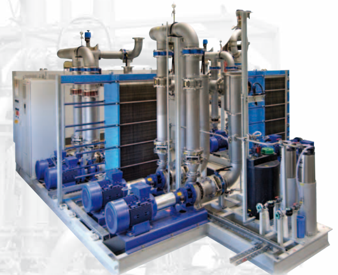
Capacity: 4 x 5.000 kW