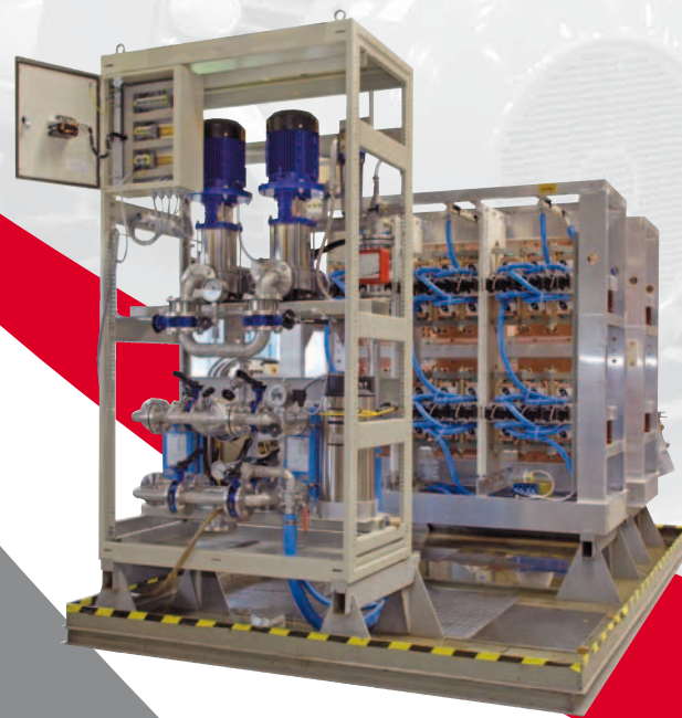
Capacity: 5 x 130 kW