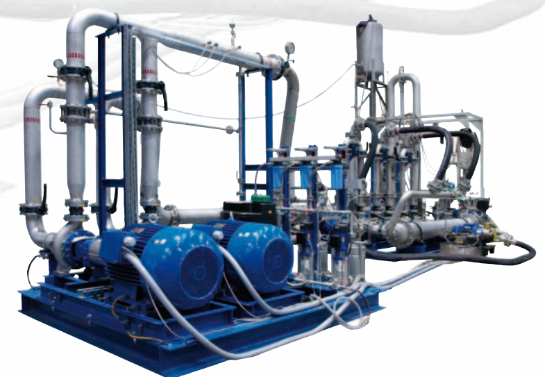
Capacity: 8 x 3.400 kW

FST Industrie GmbH Gartenfelder Straße 28 13599 Berlin Germany